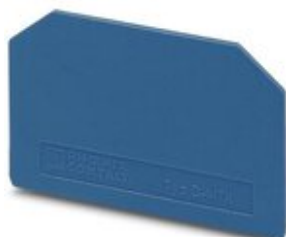
End cover, length: 46.2 mm, width: 1 mm, height: 28.3 mm, color: blue

Please be informed that the data shown in this PDF Document is generated from our Online Catalog. Please find the complete data in the user's documentation. Our General Terms of Use for Downloads are valid ( http://phoenixcontact.com/download )